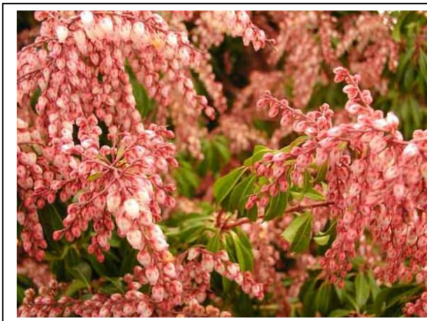
'Dorthy Wycoff' Pieris – Pieris japonica 'Dorthy Wycoff'