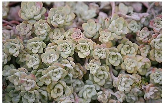
Sedum spathulifolium 'Cape Blanco' 4" H x 12" W Z5-9 Star-shaped, yellow flowers in tight clusters in summer. Forms a nice carpet.