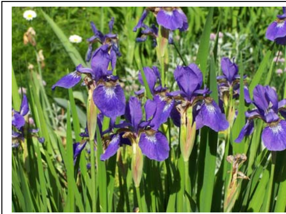
Siberian Iris – Iris sibirica Z 2-9 1-3' H/W

Main: Prune if needed after flowering. Feed: Hollytone Acid food in early Spring.